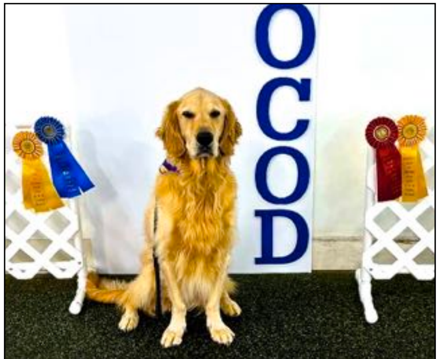
Kay Bell's "Spencer"