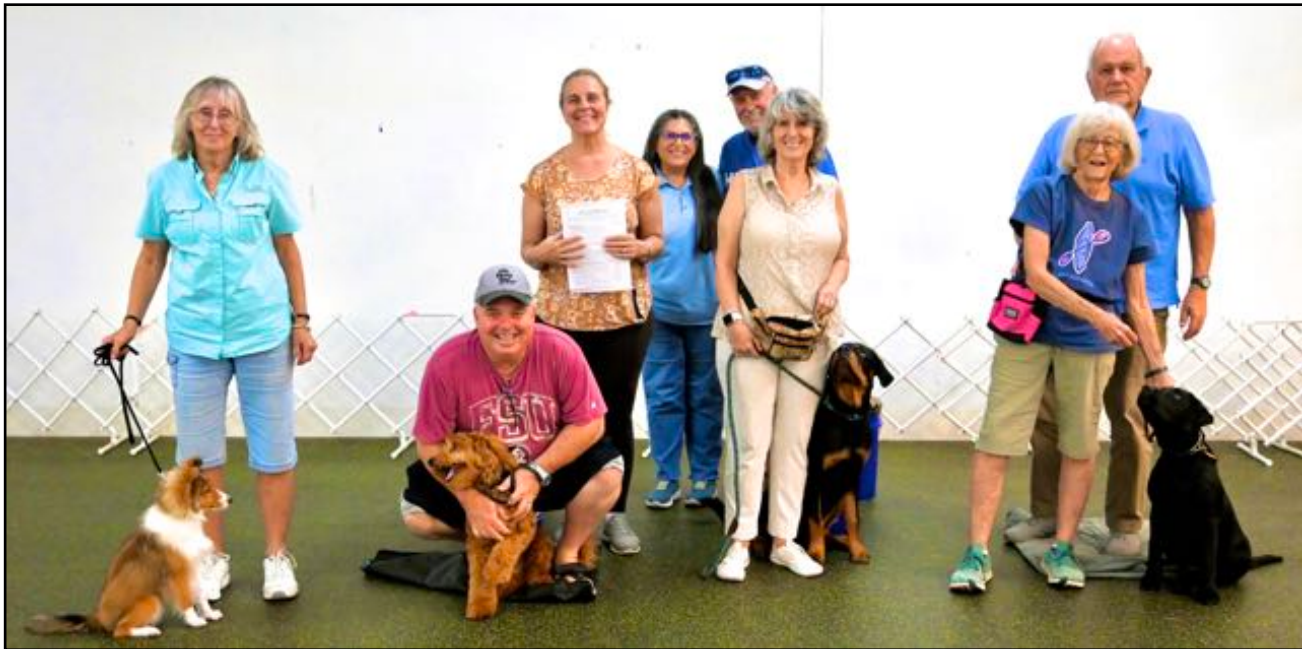
PUPPY CLASS GRADUATION on September 25, 2025

Pat Mozden called the meeting to order at 7:00pm. The sign in sheet had 15 members listed. Minutes of the last meeting were not read because they were published in the Chatterbarks newsletter.