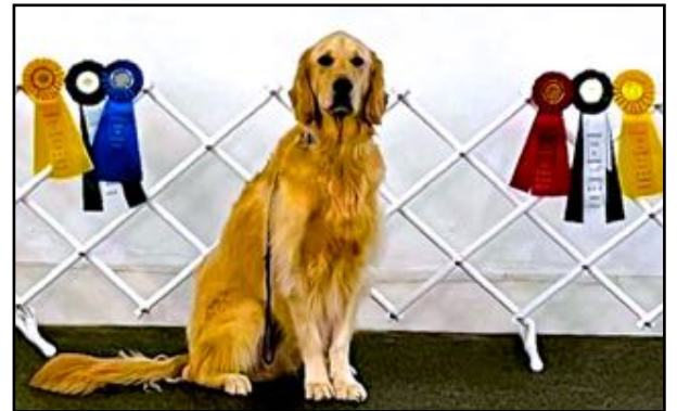
Kay Bell's "Spencer"