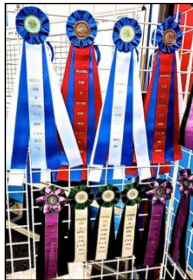
Ribbons for the Scent Work Trial